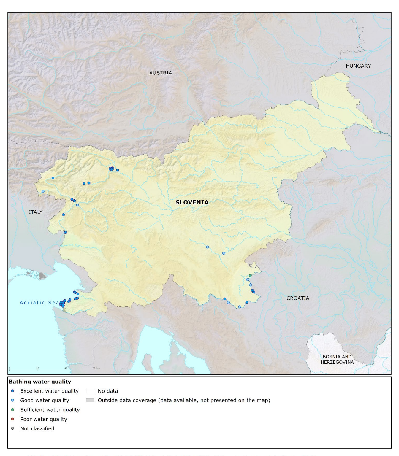
Map 1: Bathing waters reported during the 2022 bathing season in Slovenia