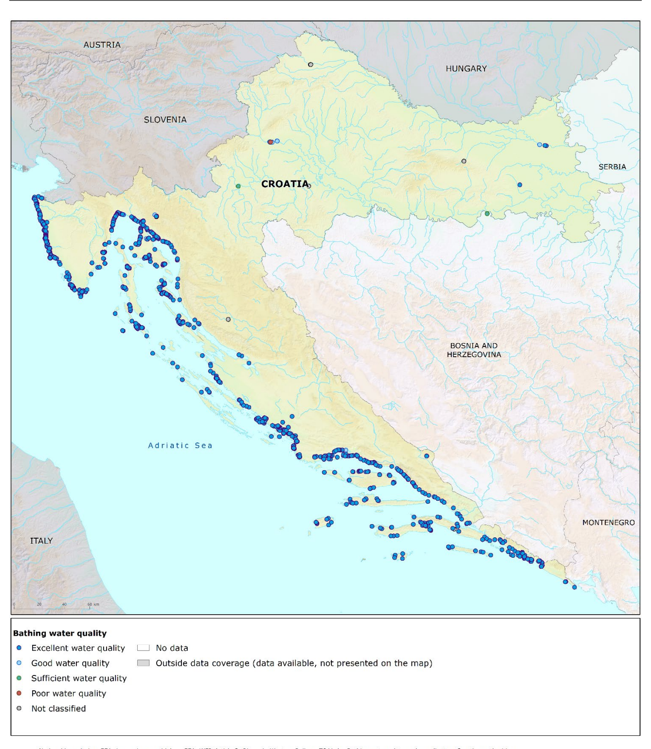
Map 1: Bathing waters reported during the 2022 bathing season in Croatia