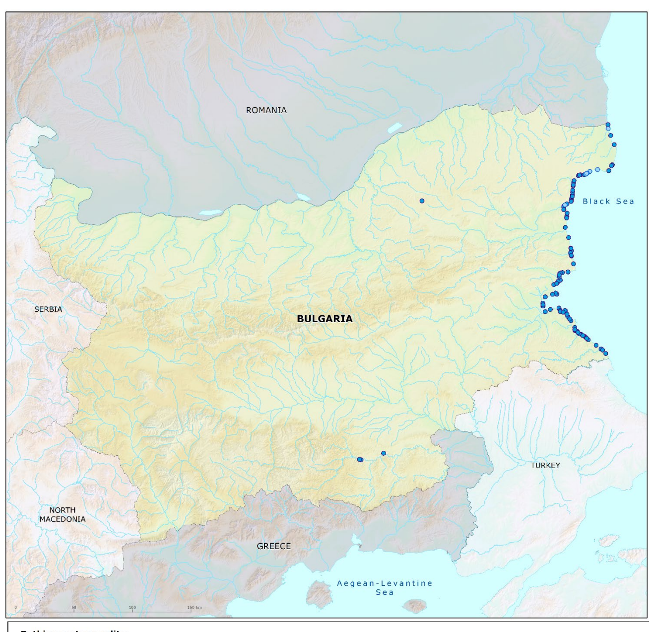
Map 1: Bathing waters reported during the 2022 bathing season in Bulgaria