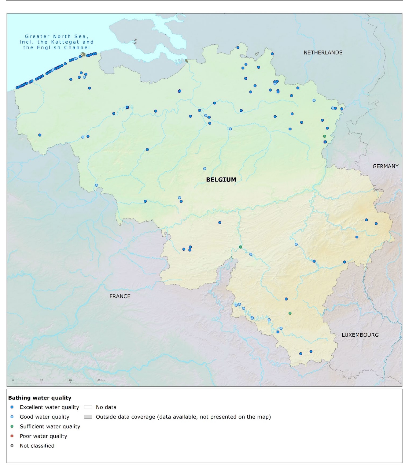
Map 1: Bathing waters reported during the 2022 bathing season in Belgium