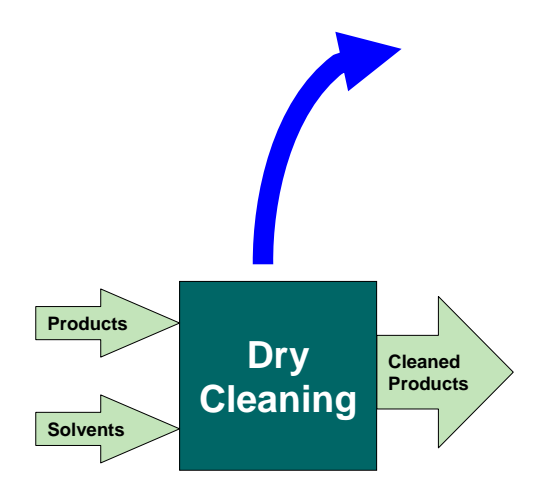
Figure 2-1 Process scheme for source category 3.B.2 Dry cleaning

Clothes are first cleaned in a solvent bath, followed by drying in hot air. The solvents are regenerated and the dirt and grease from the cleaning process are removed as a waste product.