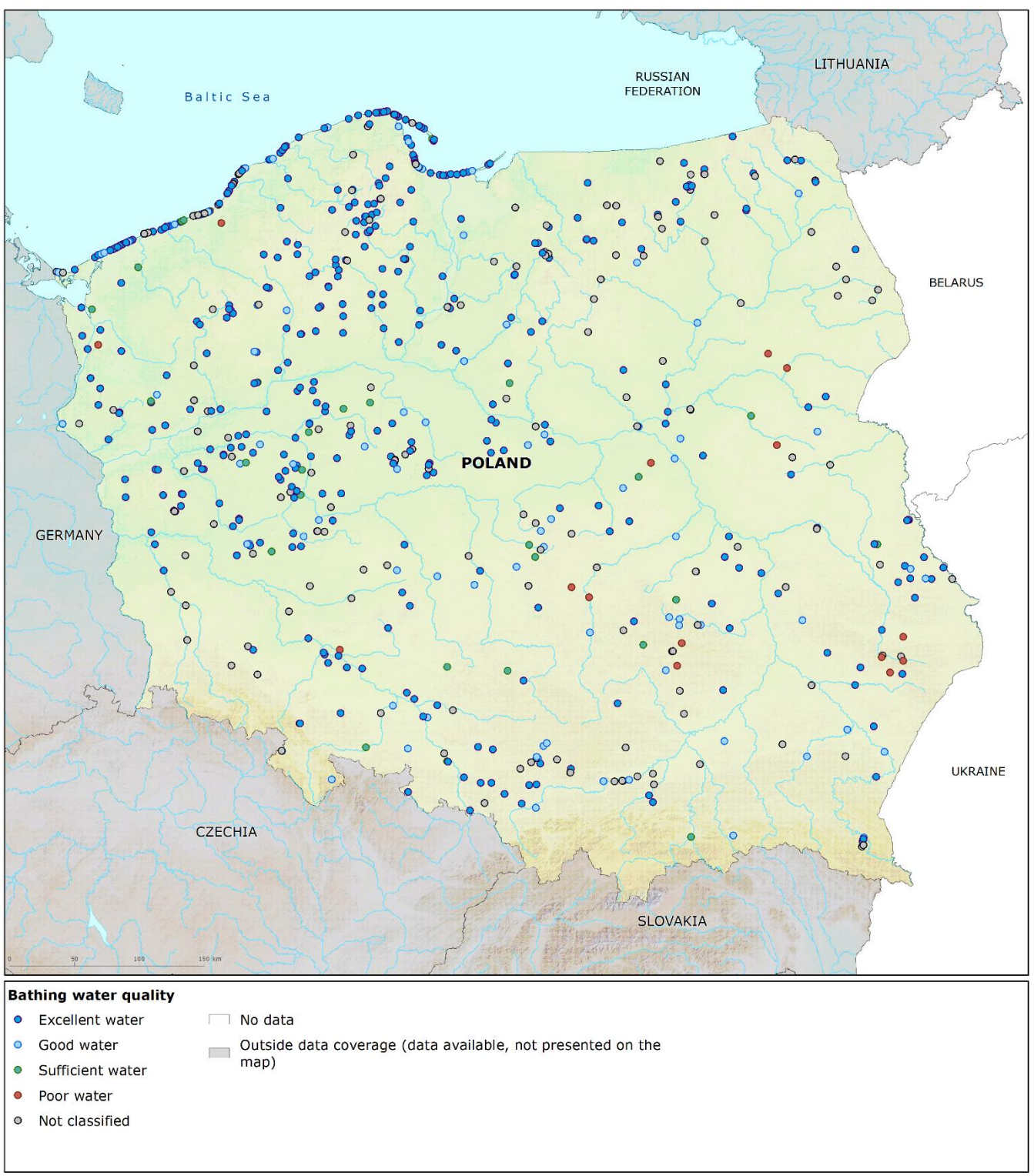
Map 1: Bathing waters reported during the 2023 bathing season in Poland