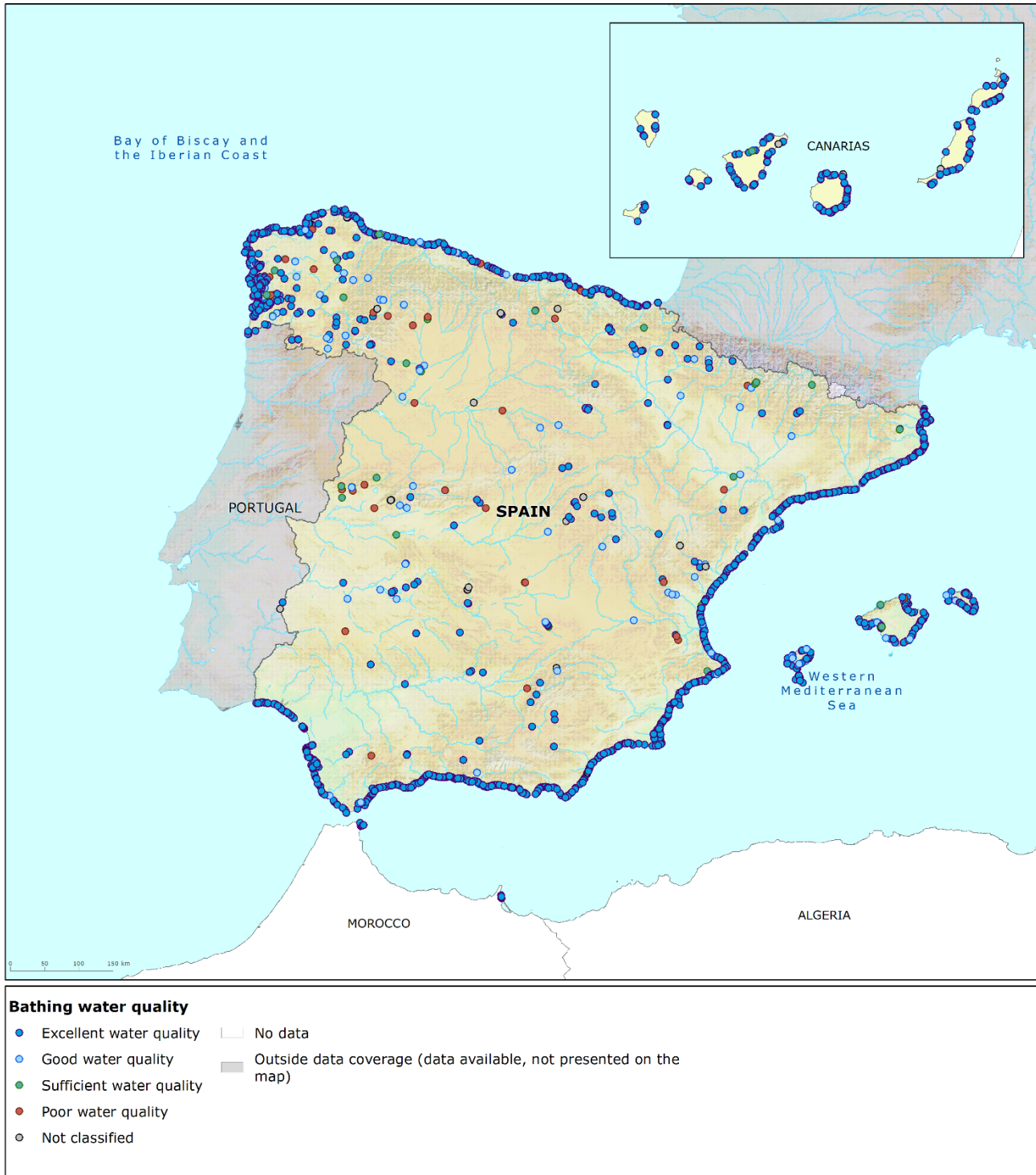
Map 1: Bathing waters reported during the 2024 bathing season in Spain

Source: National boundaries: EEA; Large rivers and lakes: EEA, WFD Article 3; Bathing waters data and coordinates: Spanish authorities; Digital Elevation Model over Europe (EU-DEM): EEA.