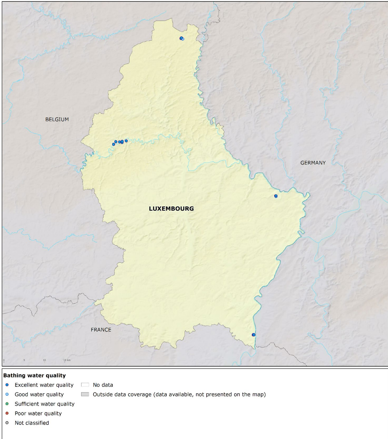
Map 1: Bathing waters reported during the 2024 bathing season in Luxembourg