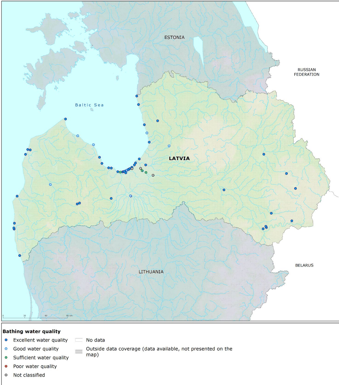
Map 1: Bathing waters reported during the 2024 bathing season in Latvia