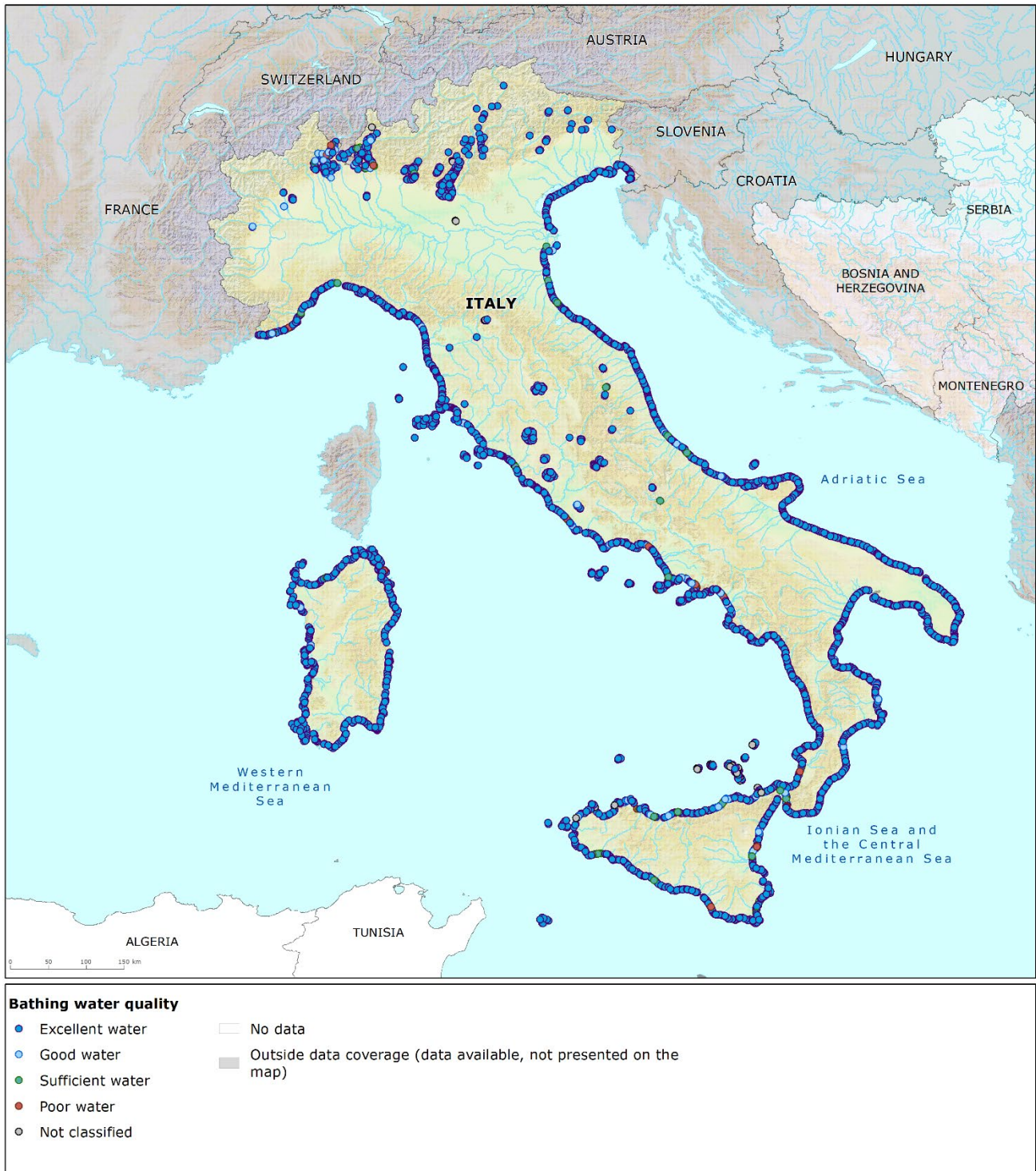
Map 1: Bathing waters reported during the 2024 bathing season in Italy

Source: National boundaries: EEA; Large rivers and lakes: EEA, WFD Article 3; Rivers in Western Balkan: TC Vode; Bathing waters data and coordinates: Italian authorities; Digital Elevation Model over Europe (EU-DEM): EEA.