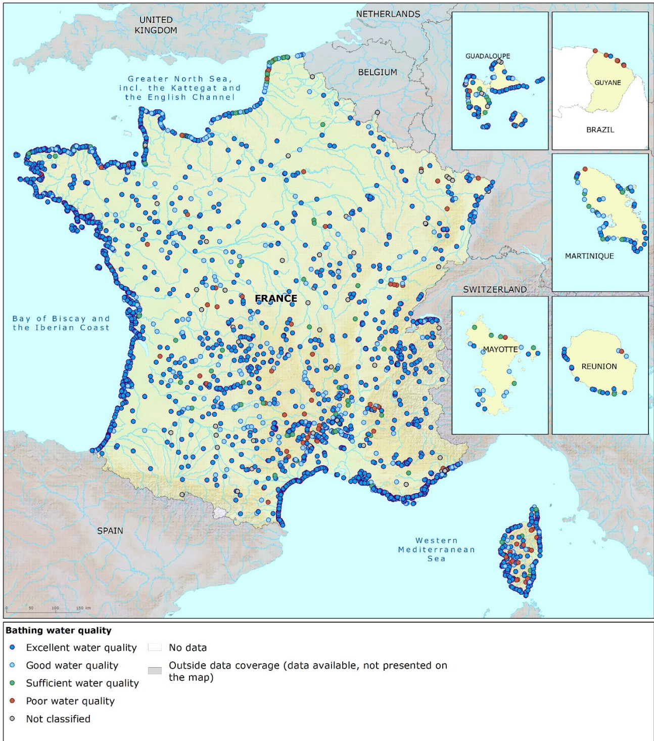
Map 1: Bathing waters reported during the 2024 bathing season in France