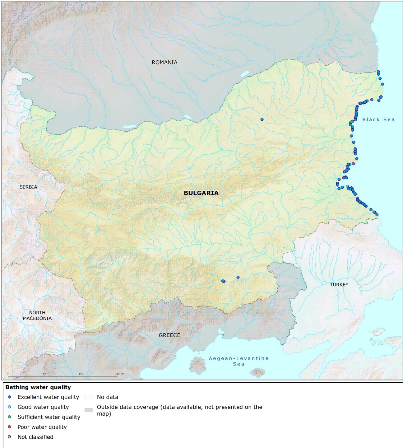
Map 1: Bathing waters reported during the 2024 bathing season in Bulgaria