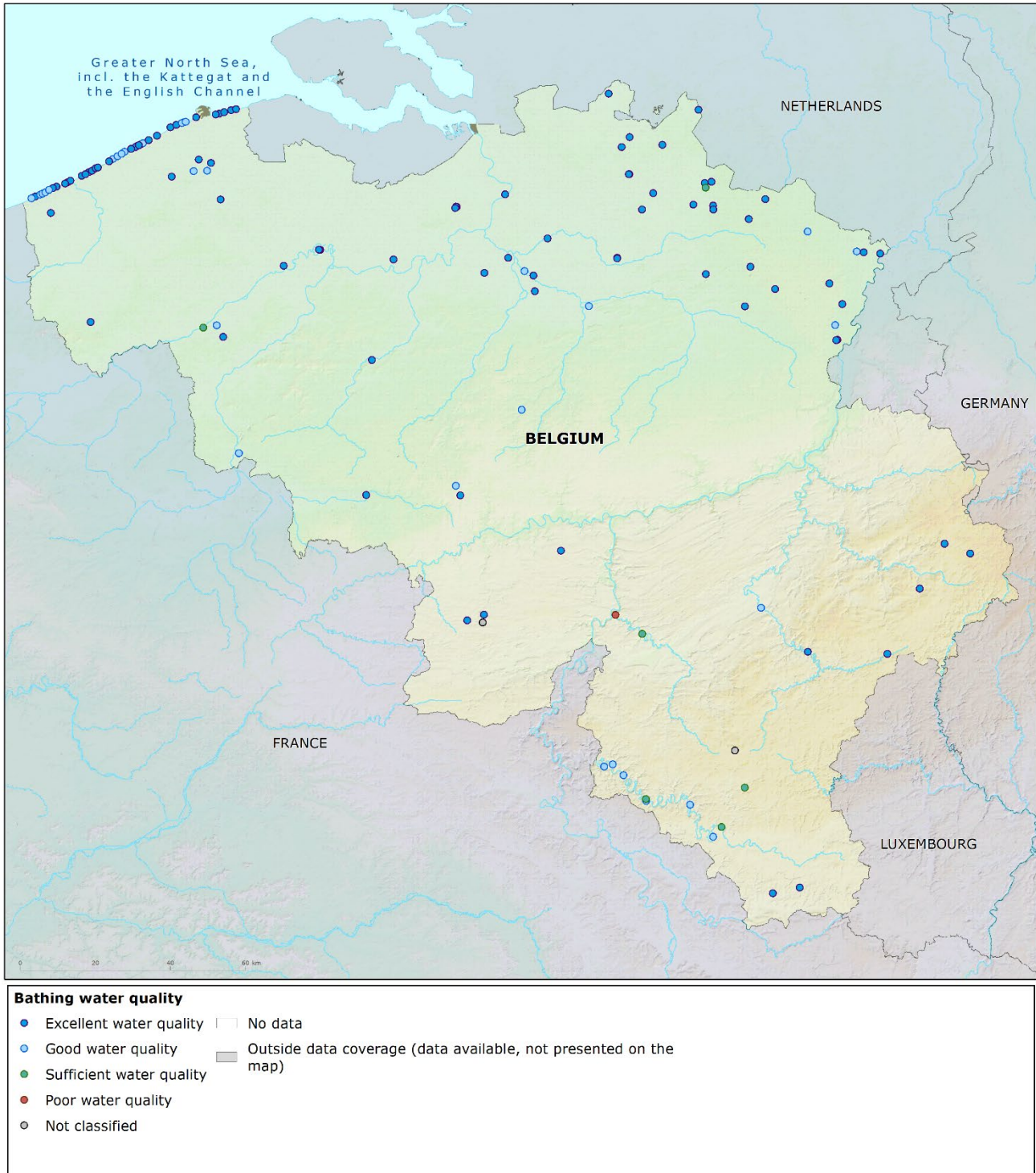
Map 1: Bathing waters reported during the 2024 bathing season in Belgium