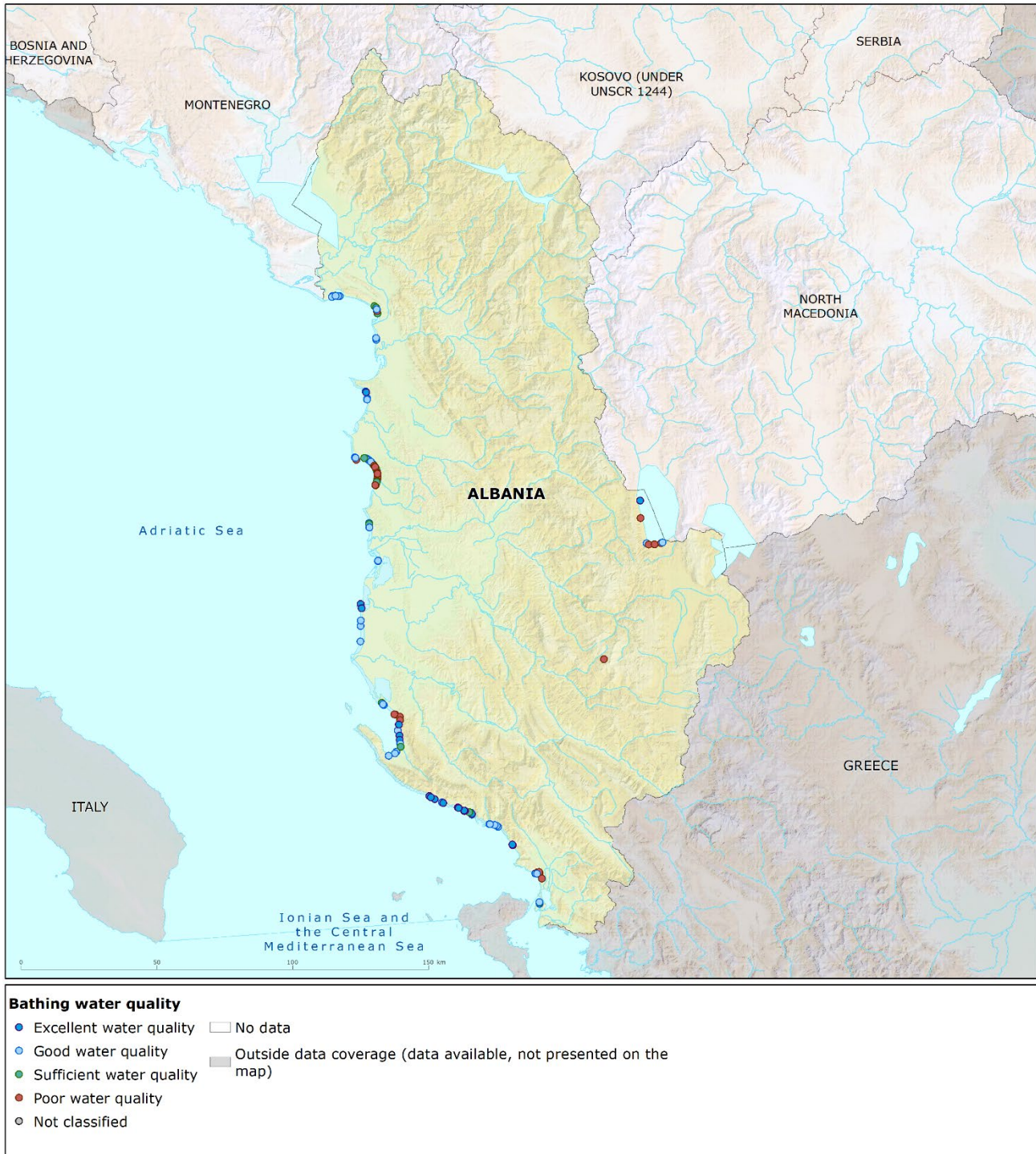
Map 1: Bathing waters reported during the 2024 bathing season in Albania