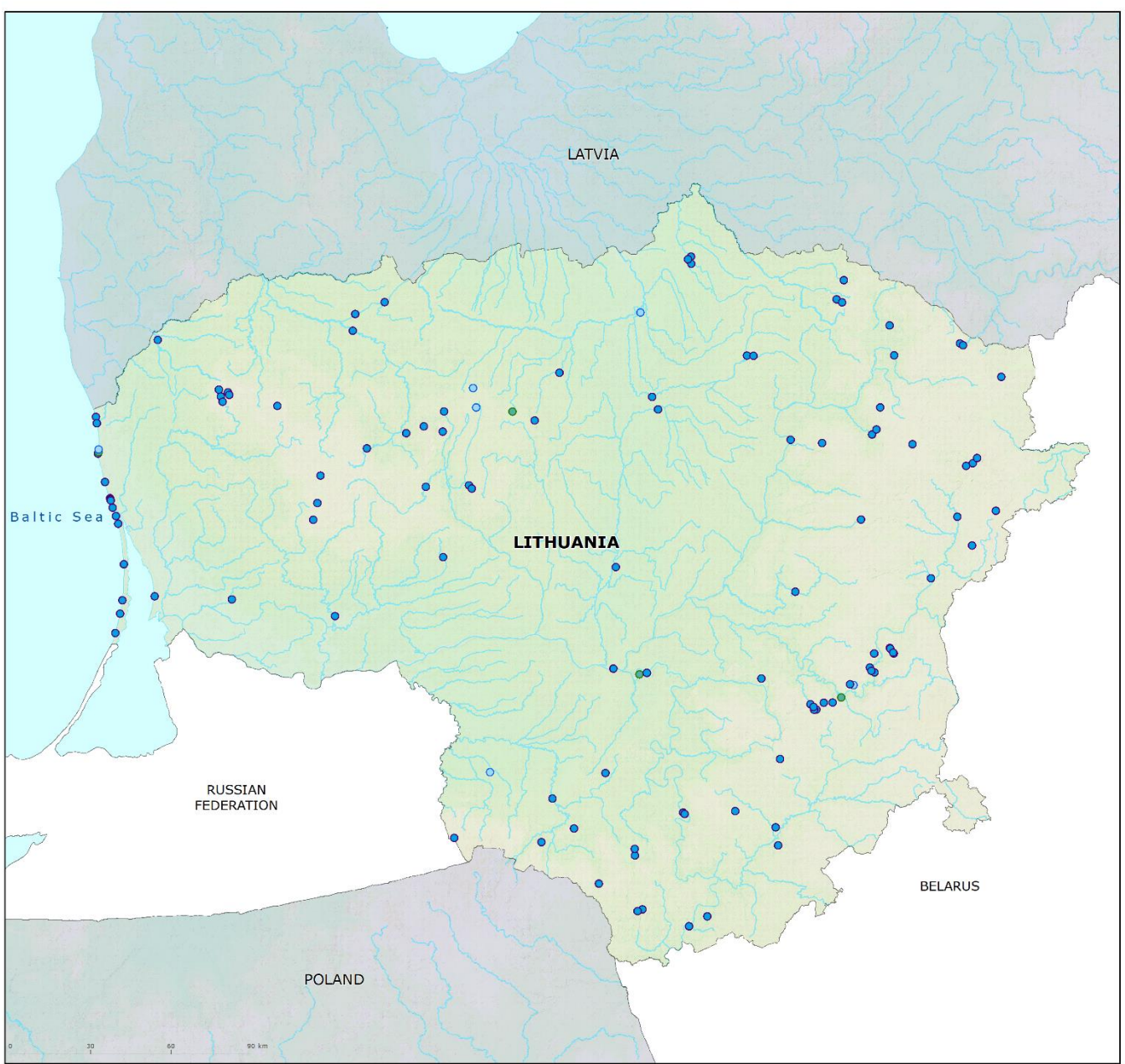
Map 1: Bathing waters reported during the 2023 bathing season in Lithuania