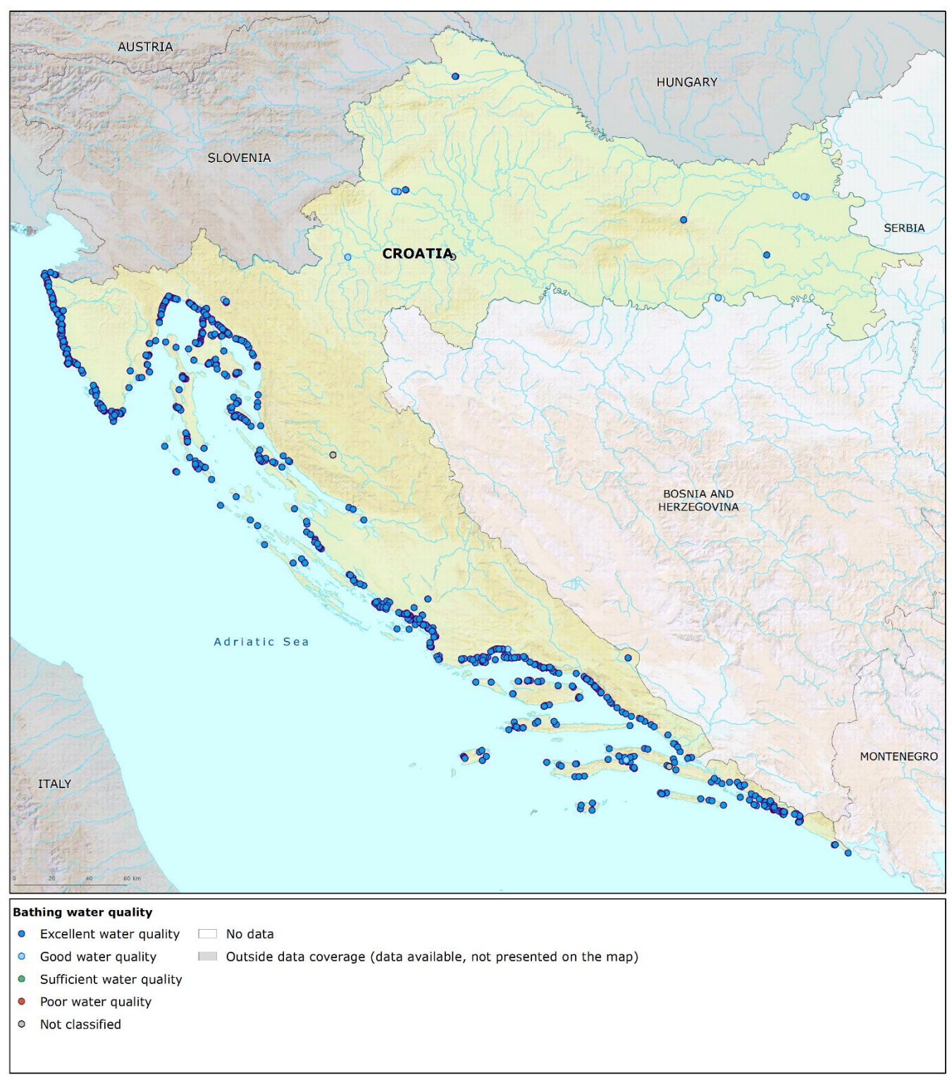
Map 1: Bathing waters reported during the 2023 bathing season in Croatia