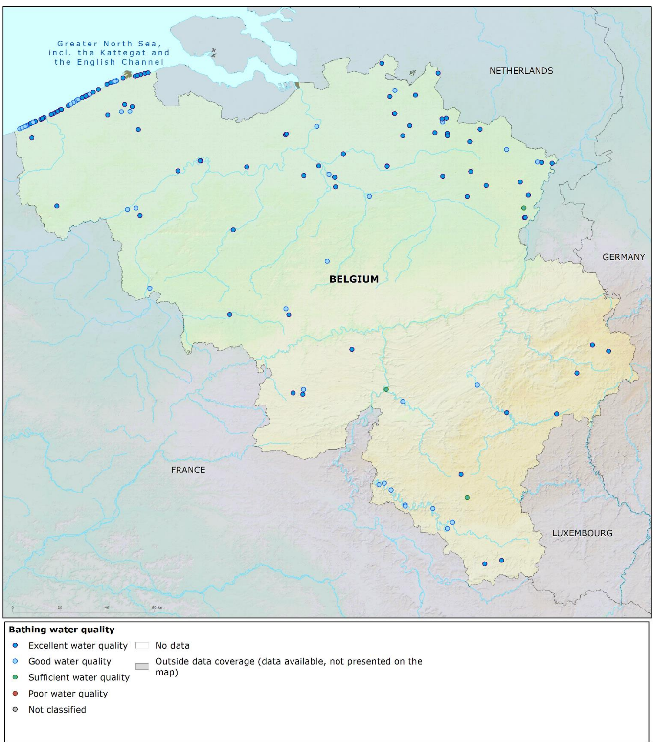
Map 1: Bathing waters reported during the 2023 bathing season in Belgium