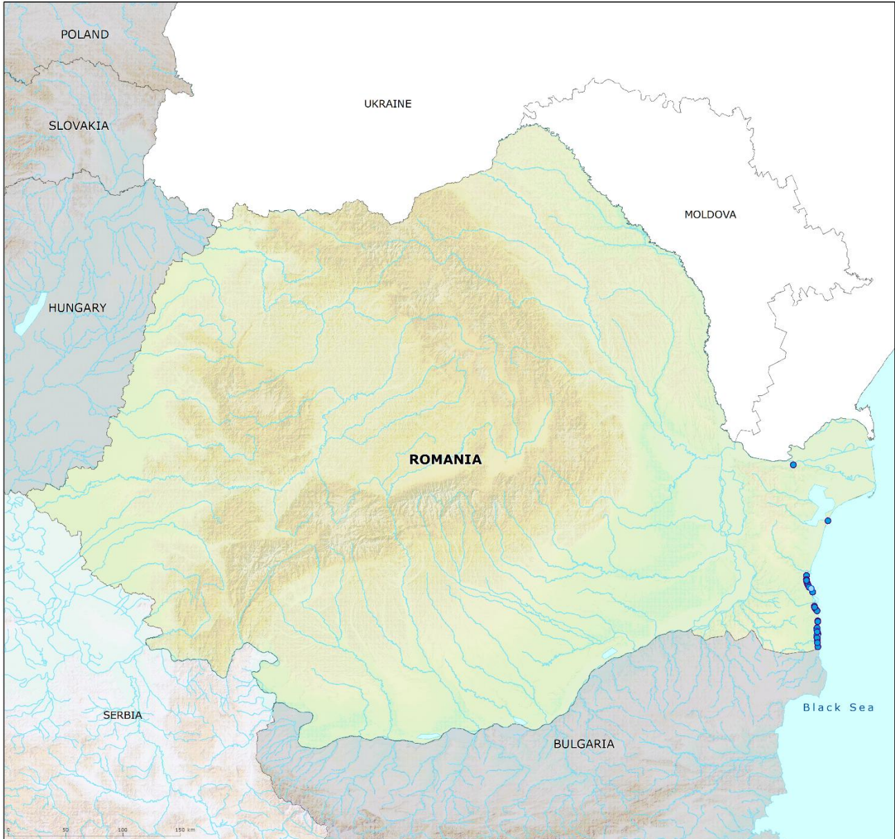
Map 1: Bathing waters reported during the 2025 bathing season in Romania