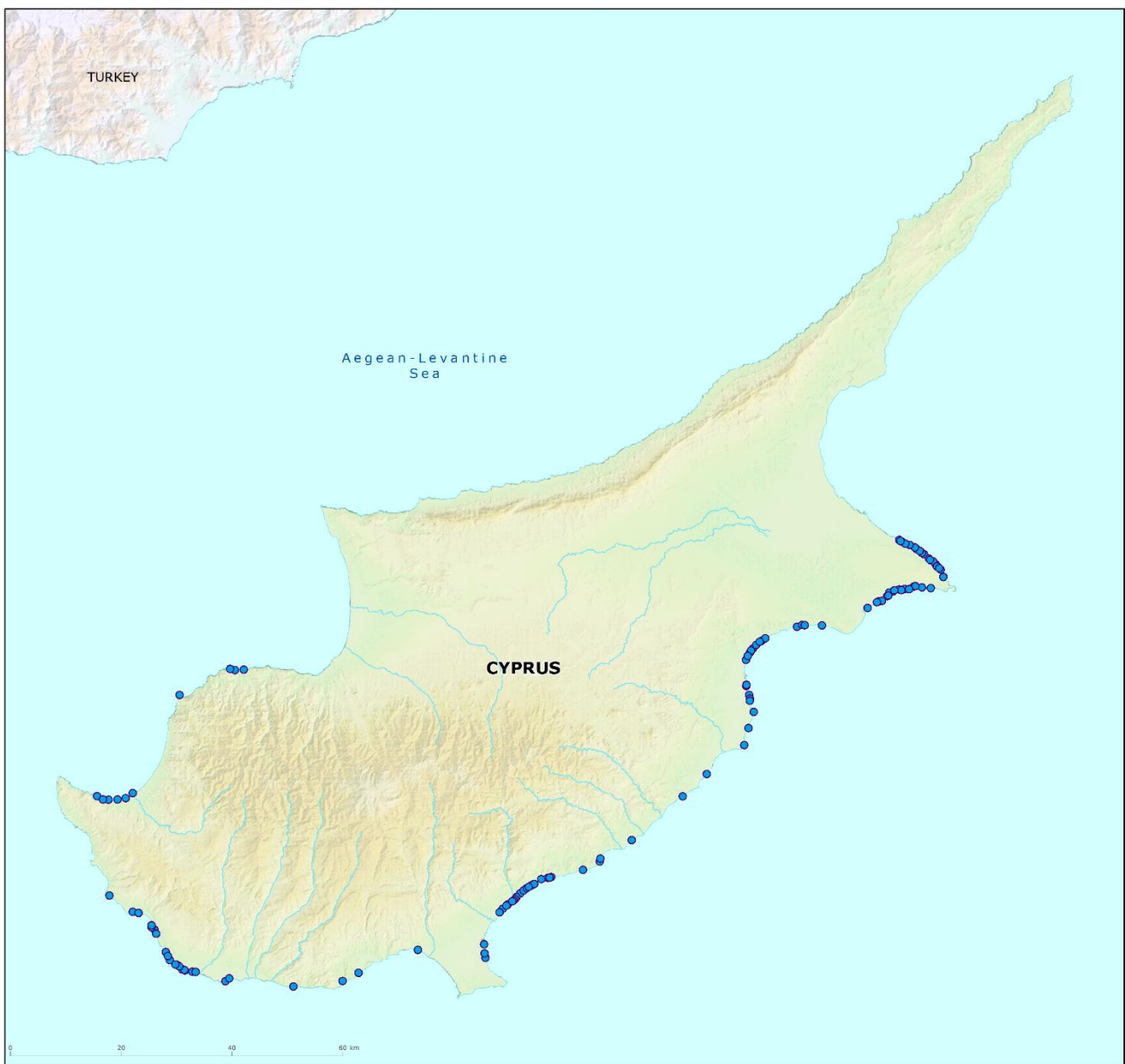
Map 1: Bathing waters reported during the 2025 bathing season in Cyprus