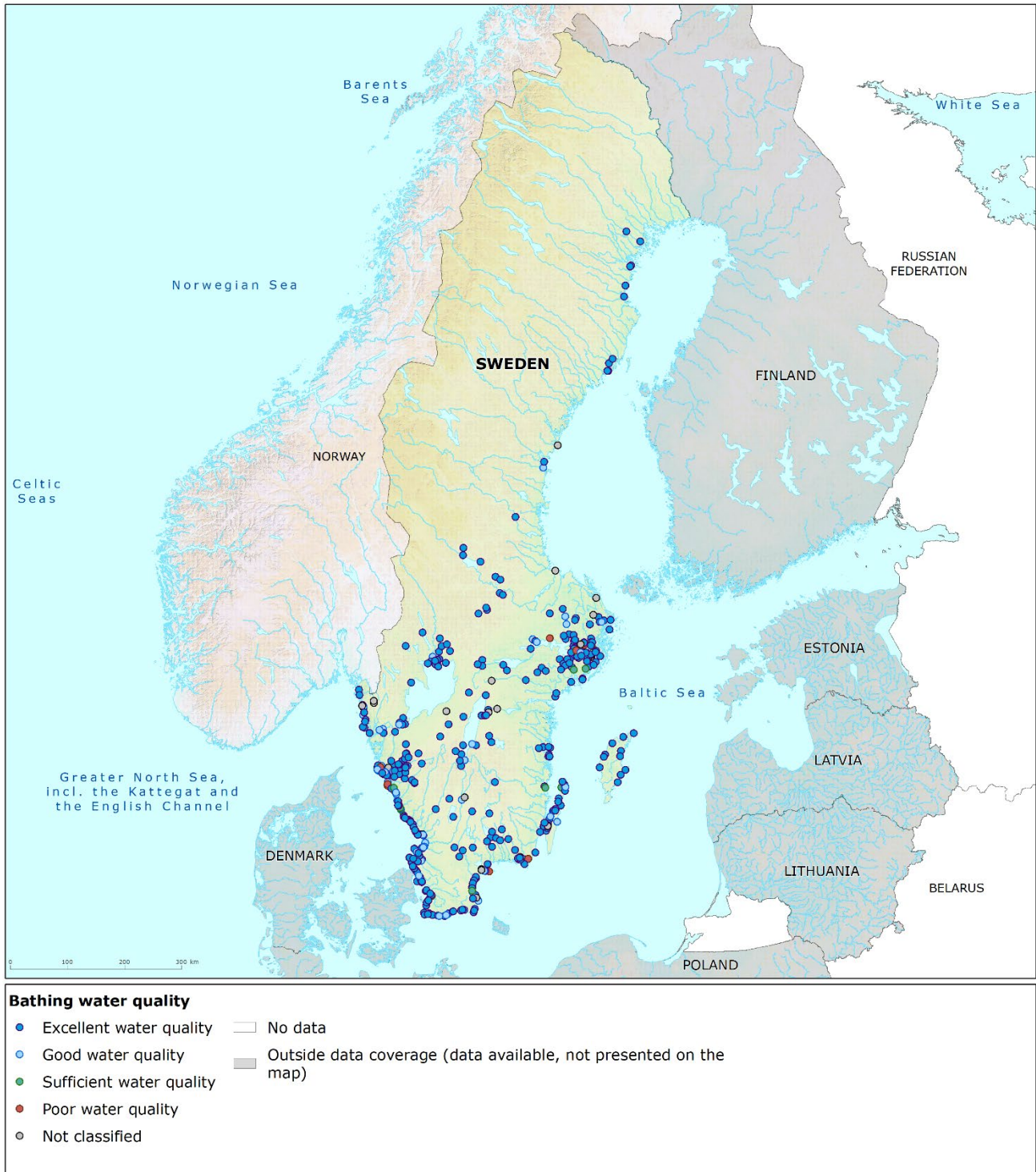
Map 1: Bathing waters reported during the 2024 bathing season in Sweden