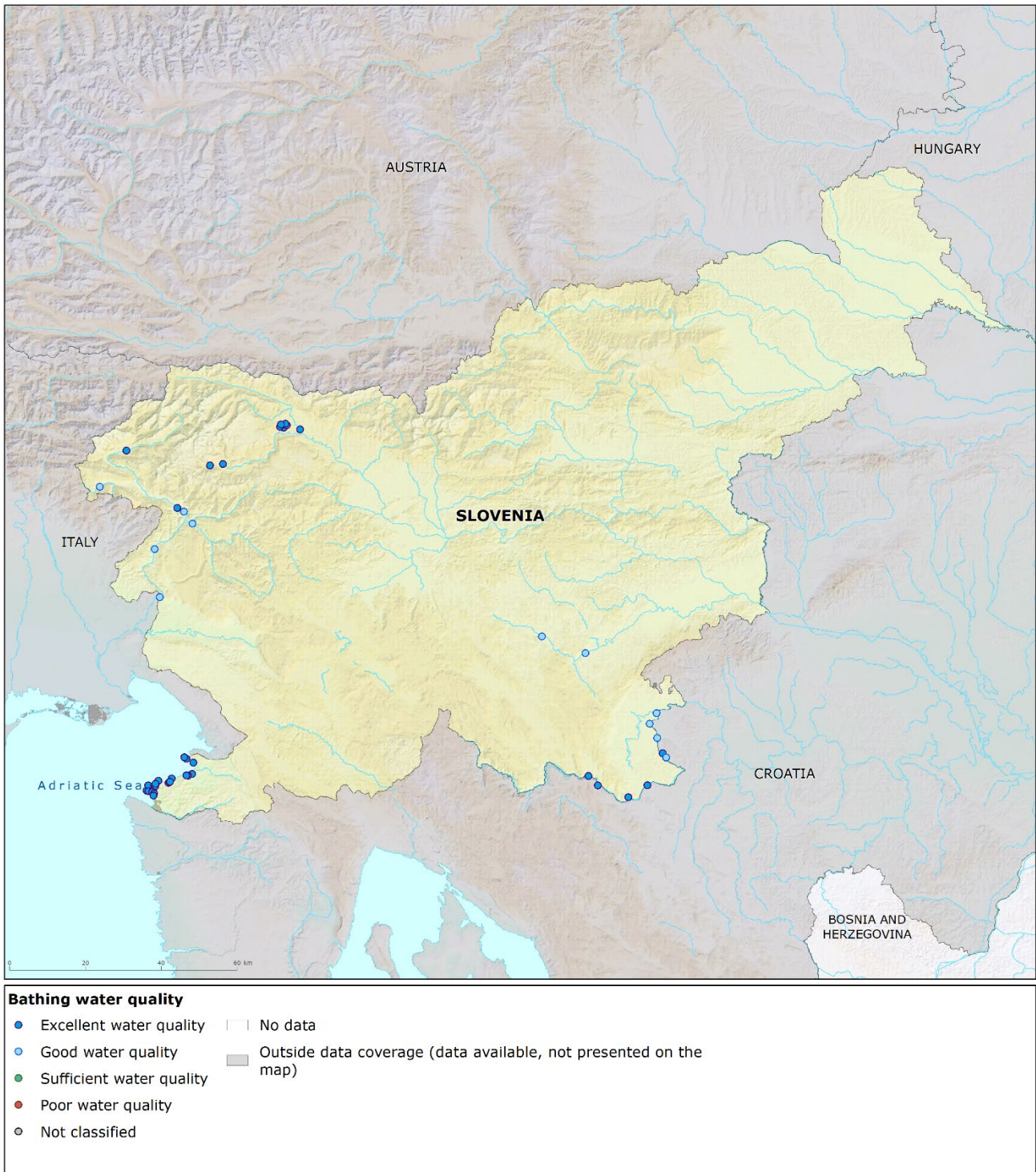
Map 1: Bathing waters reported during the 2024 bathing season in Slovenia