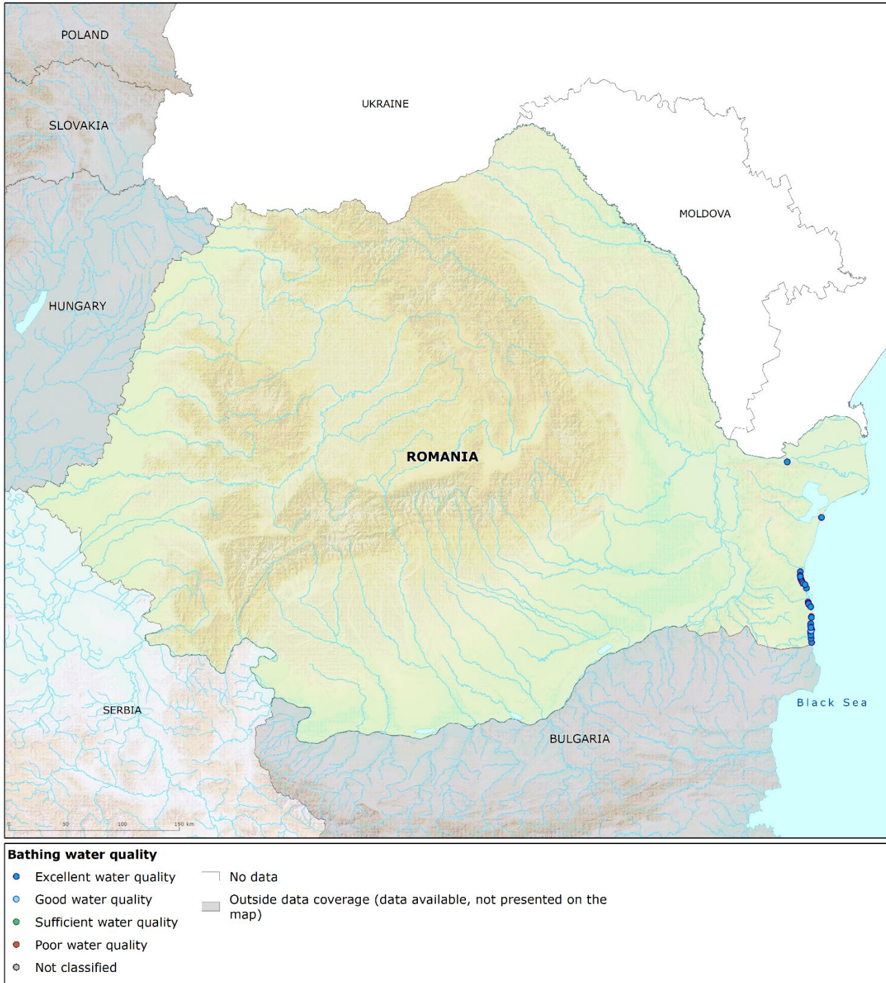
Map 1: Bathing waters reported during the 2024 bathing season in Romania