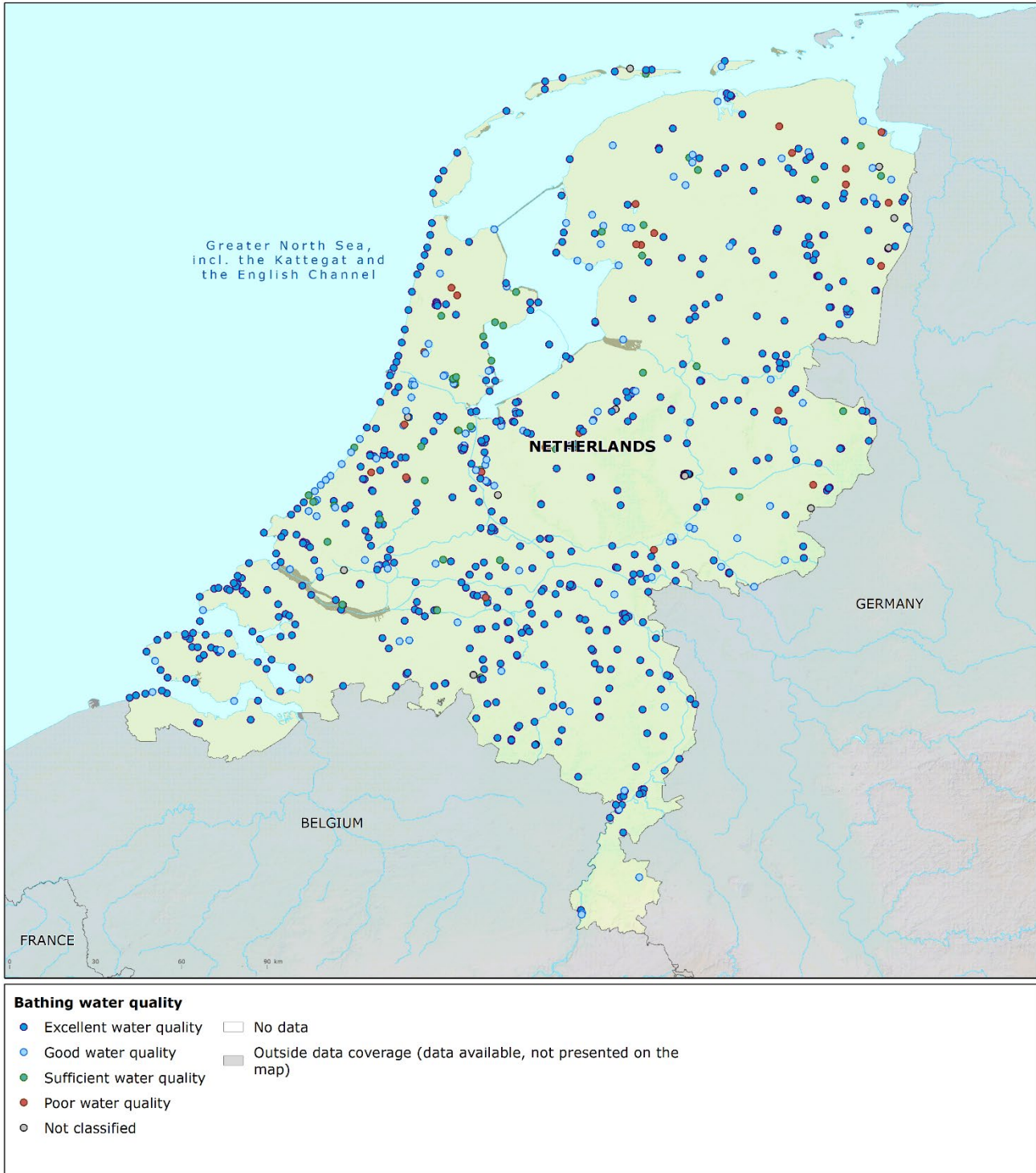
Map 1: Bathing waters reported during the 2024 bathing season in the Netherlands