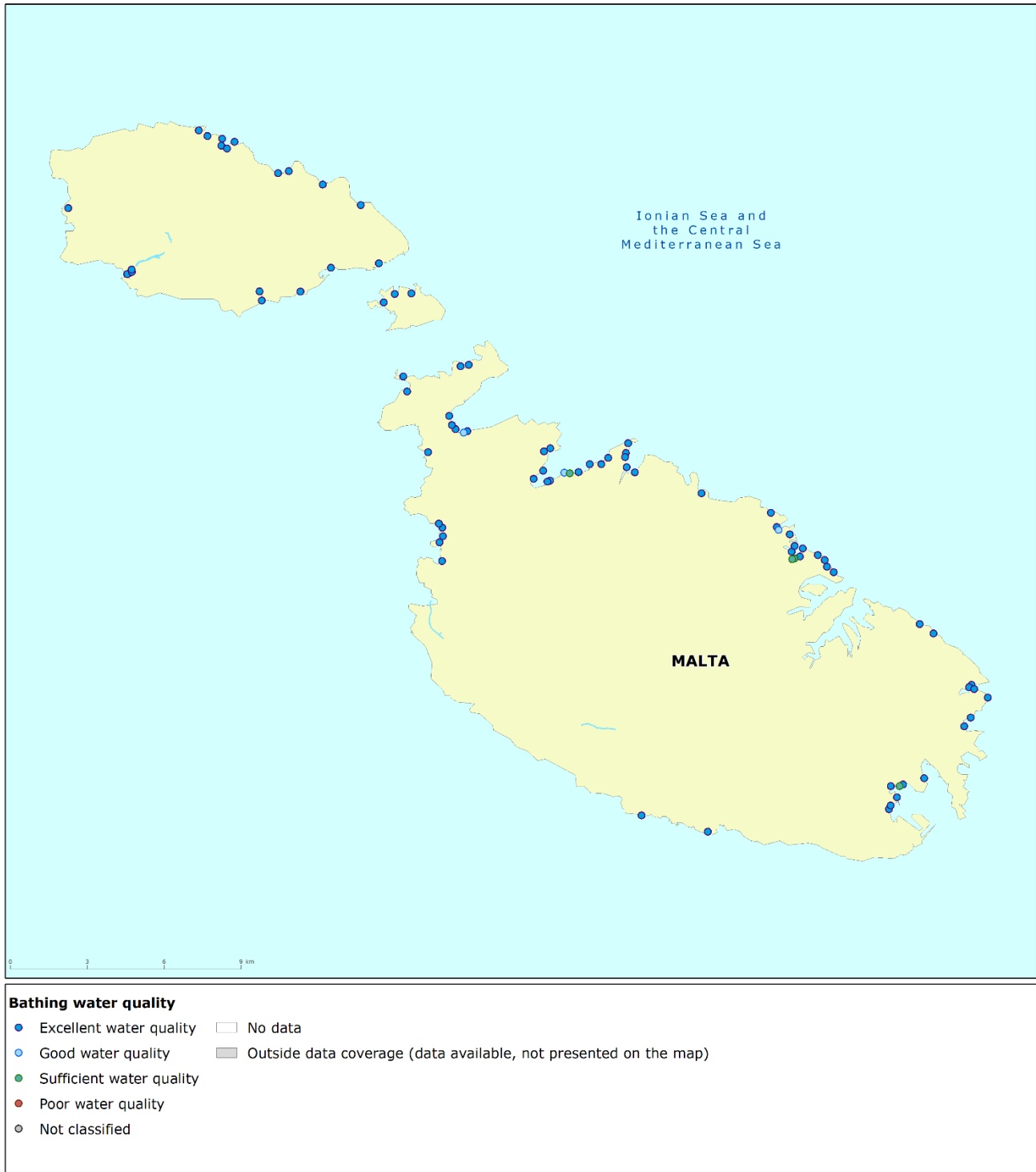
Map 1: Bathing waters reported during the 2024 bathing season in Malta

Source: National boundaries: EEA; Large rivers and lakes: EEA, WFD Article 3; Bathing waters data and coordinates: Maltese authorities; Digital Elevation Model over Europe (EU-DEM): EEA.