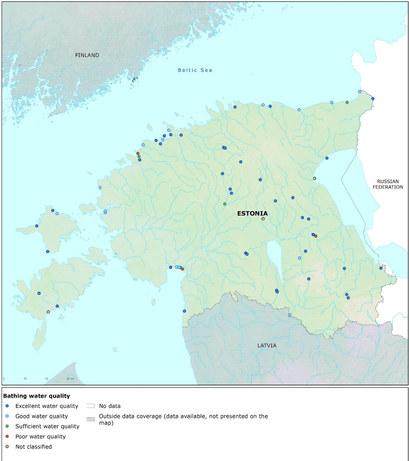
Map 1: Bathing waters reported during the 2024 bathing season in Estonia