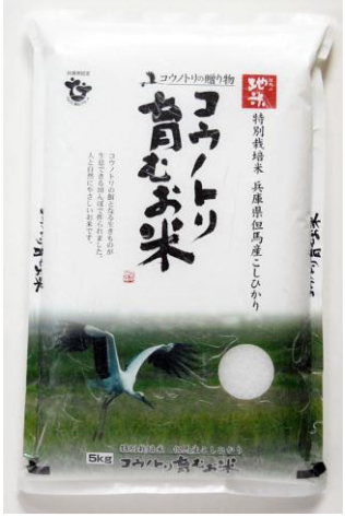
Photo 2: Rice"flying Oriental White Stork"