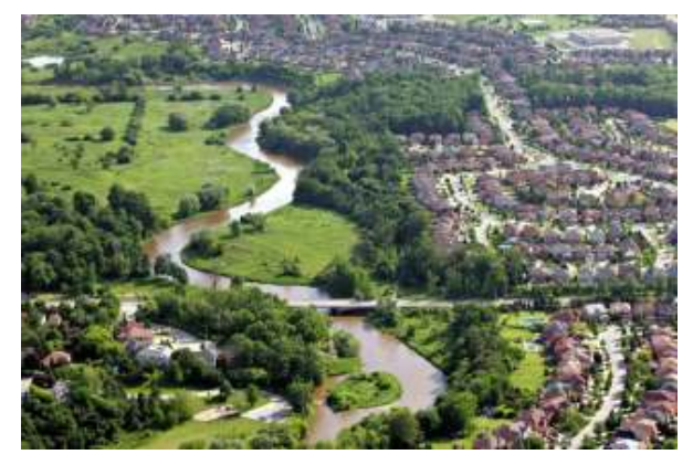
Picture 2: City of Mississauga and the Credit River