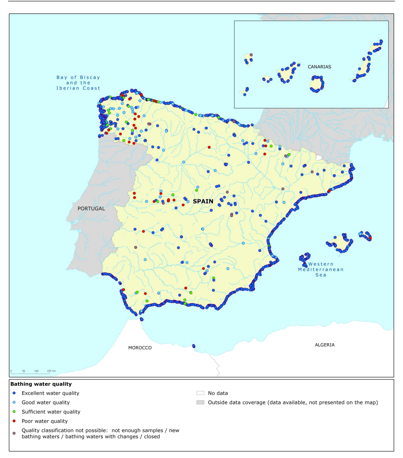
Map 1: Bathing waters reported during the 2014 bathing season in Spain