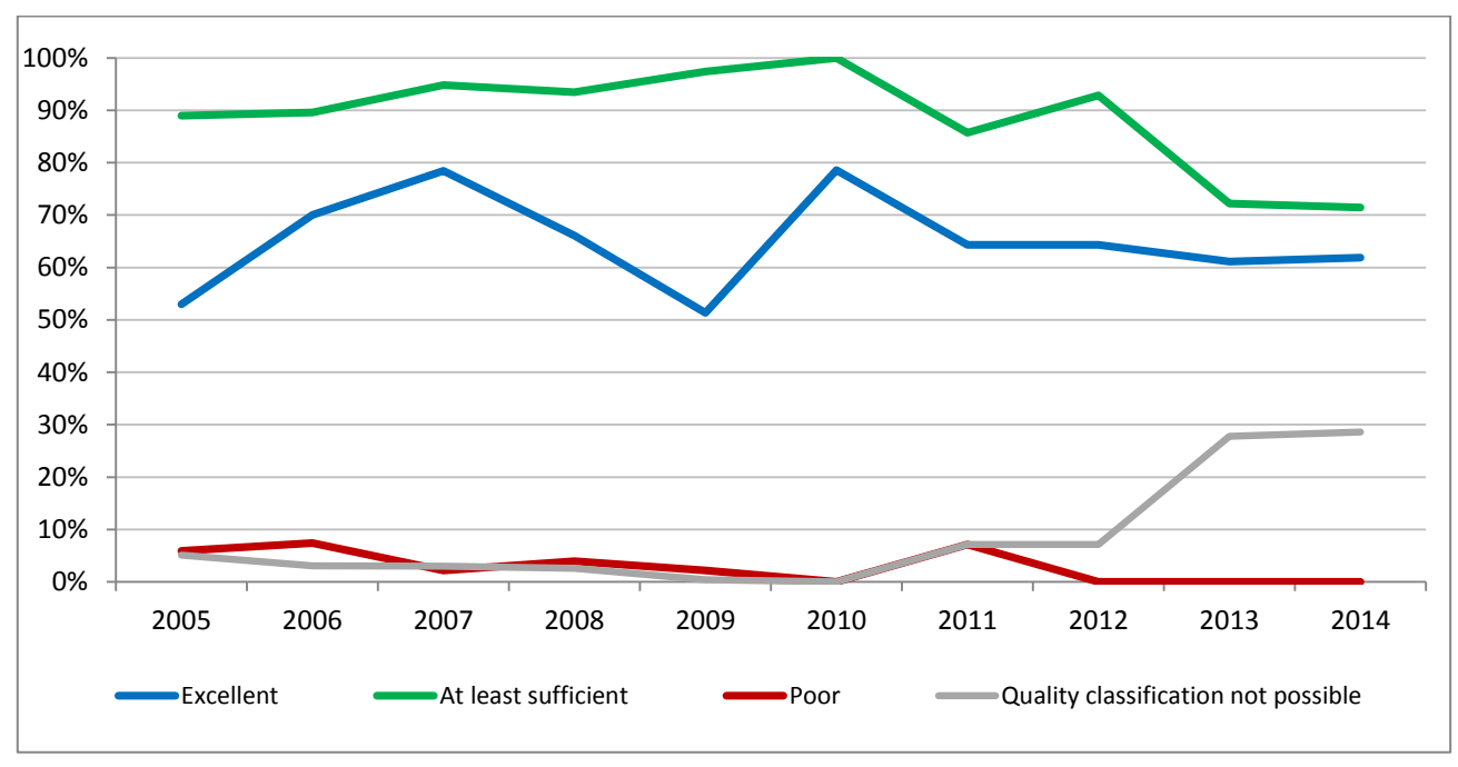
Figure 2: Inland bathing water quality trend in Latvia. Note: the "At least sufficient" class also includes bathing waters of "Excellent" quality class, the sum of shares is therefore not 100%.

71.4% of all existing inland bathing waters met at least sufficient water quality in 2014. The rest was new and could not be quality-classified yet. See Appendix 1 for numeric data.