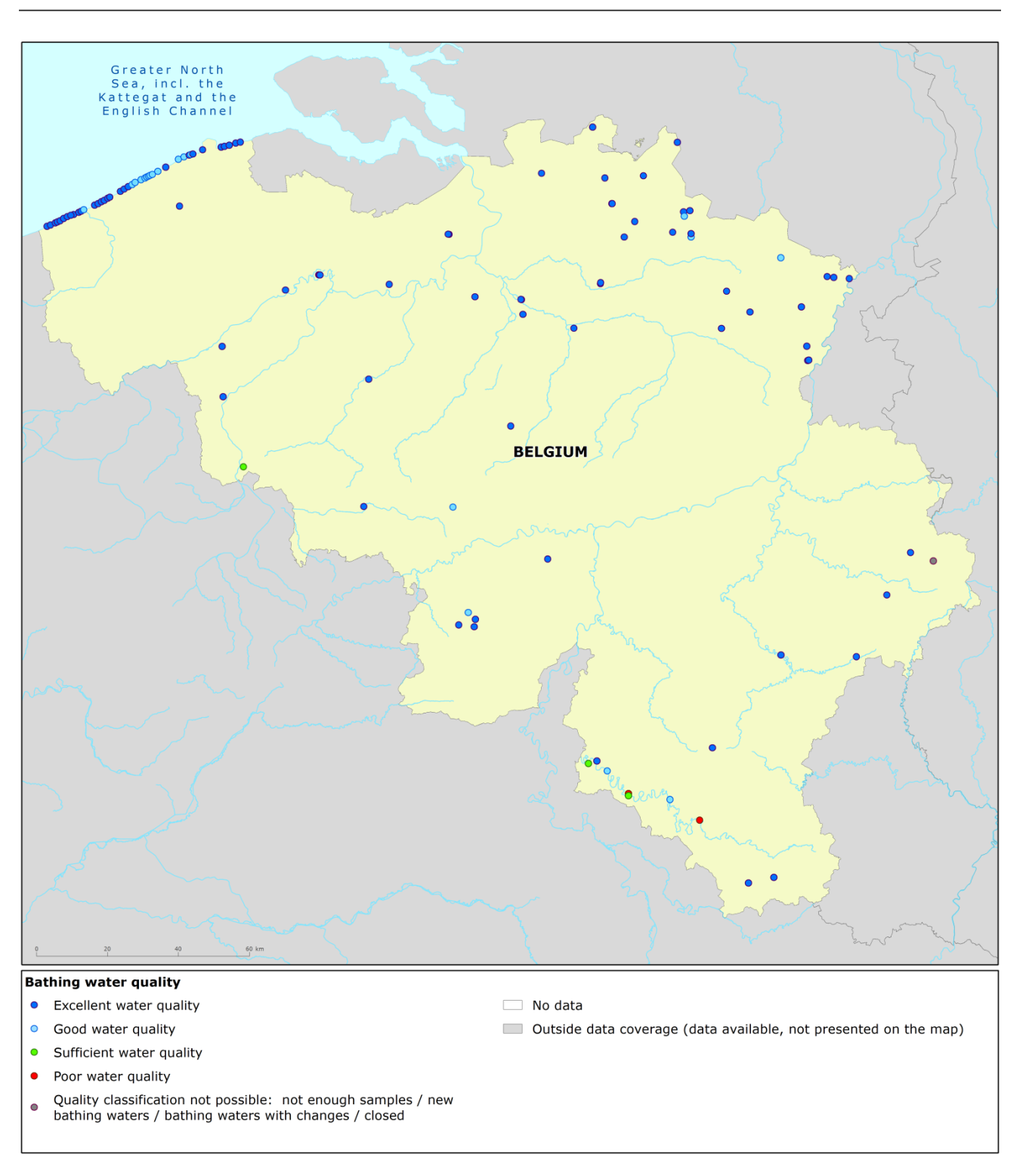
Map 1: Bathing waters reported during the 2014 bathing season in Belgium