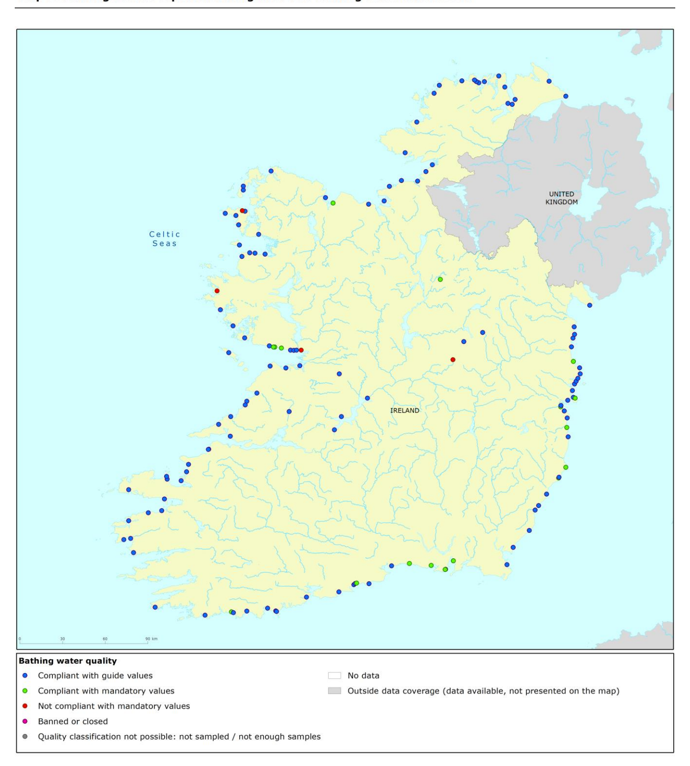
Map 1: Bathing waters reported during the 2013 bathing season in Ireland