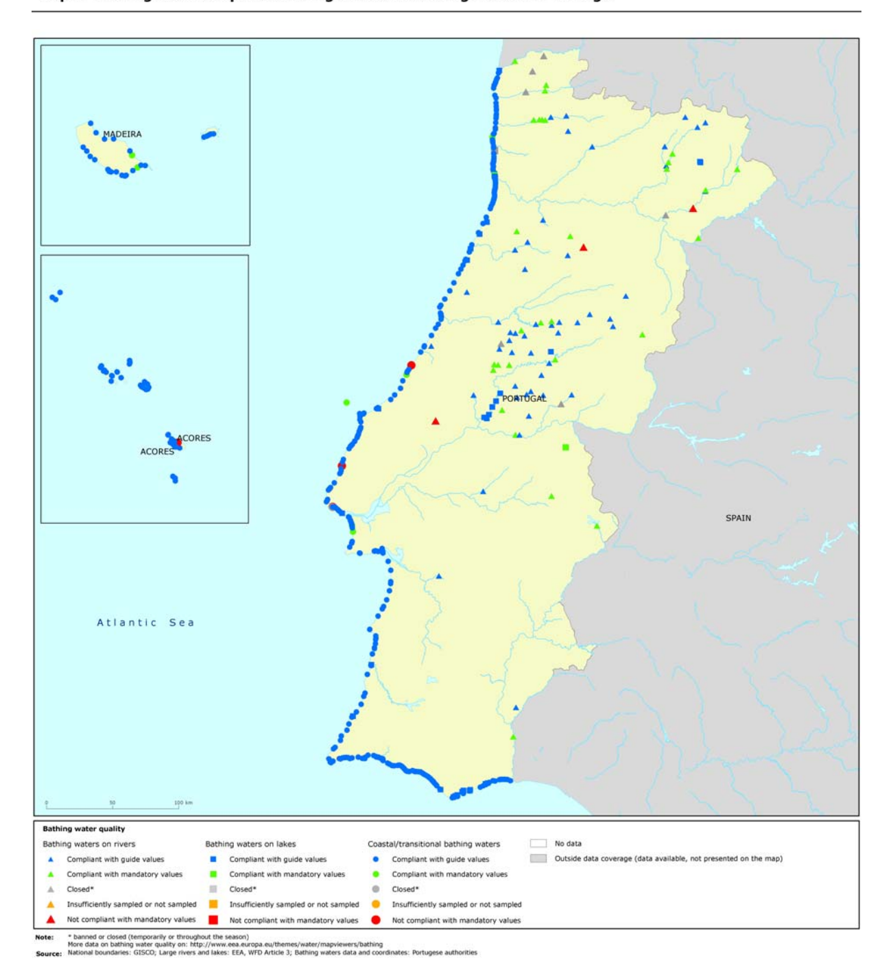
Map 1: Bathing waters reported during the 2009 bathing season in Portugal