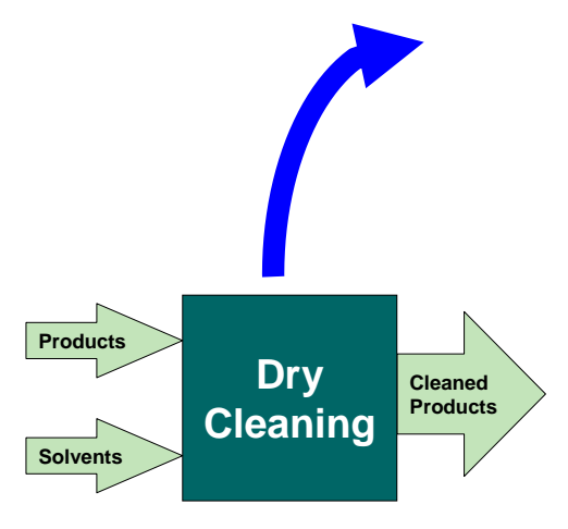
Figure 2-1 Process scheme for source category 2.D.3.f Dry cleaning

Clothes are first cleaned in a solvent bath, followed by drying in hot air. The solvents are regenerated and the dirt and grease from the cleaning process are removed as a waste product.