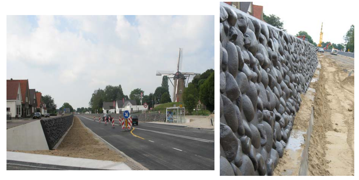
Fig 10: Current situation

Work is well under way and will continue throughout 2011. The metamorphosis of the Graafseweg is taking shape and the final phase of the 'new road' will be opened with local festivities in December, celebrating a real local achievement with the people to whom it matters most - the people of Alverna.