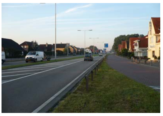
Fig 2: Graafseweg, Alverna 2010