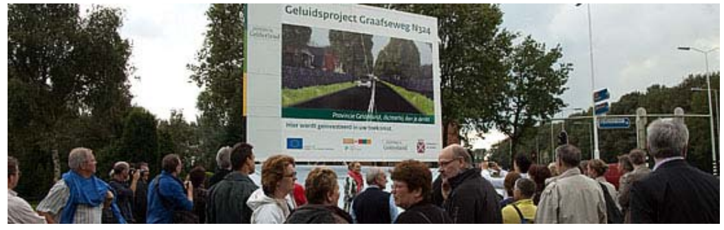
Fig 9: Start work. Extensive interactive process with village residents