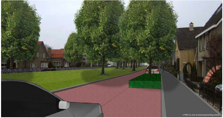
Fig 7: (Above)The new Graafseweg from the driver's perspective Fig 8: (Below) Residents, pedestrians and local traffic enjoy a quieter, 'greener' Graafseweg