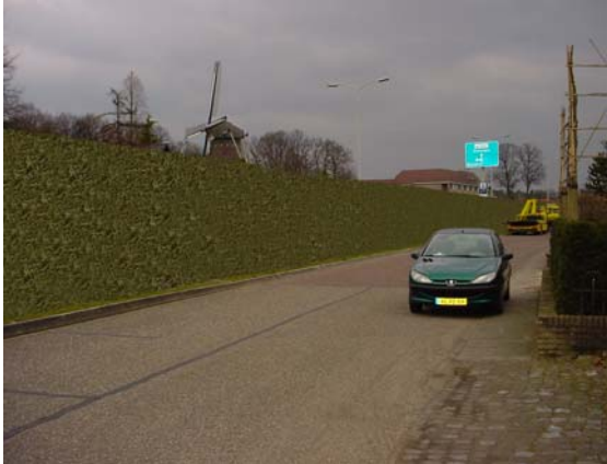
Fig 3: Old situation