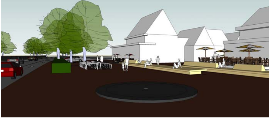
Fig 5: Alverna, an attractive place to live