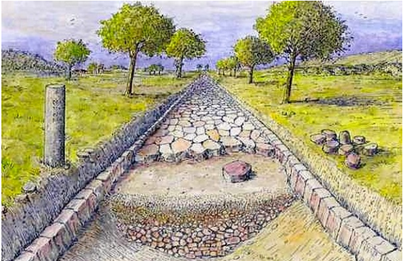
Fig 1: Impression of a Roman road, around 2000 years ago<sup>1</sup>

The 'Graafseweg' has provided a major link to the historic city of Nijmegen since Roman times. Now a busy main road, the N324 runs through the middle of the village of Alverna in the municipality Wijchen, in the Dutch province of Gelderland, connecting Nijmegen with southern villages and towns, such as Grave.