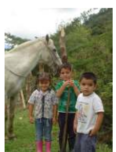
Picture 1: (Left) Benefits of fencing; Picture 2 (Centre): Riparian Buffer; Picture 3 (Right): Children residing in the East Cauca Valley